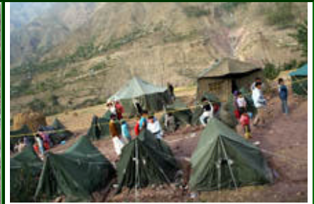
Community living in tents in a relief camp under very temporary protection.