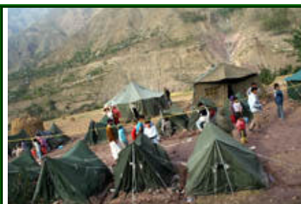
Community living in tents in a relief camp under very temporary protection.