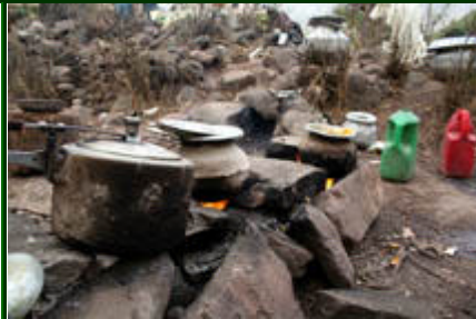
Everything is destroyed, including the household items.