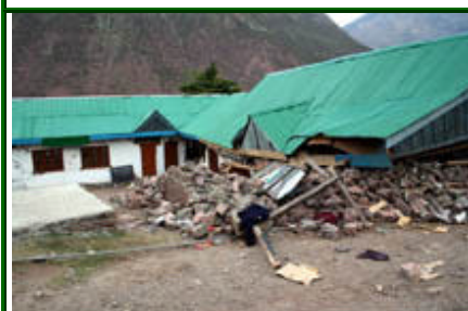
Badly damaged shelters are dotted everywhere.