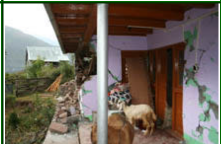
Earthquake devastation leaves not only humans destitute, but livestock also.