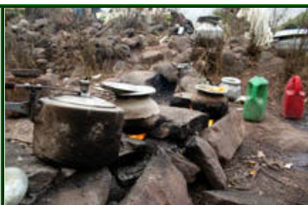
Everything is destroyed, including the household items.