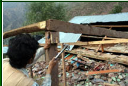
A victim trying to join some wooden poles with a hope to prop up a temporary and safe place before snowfall.