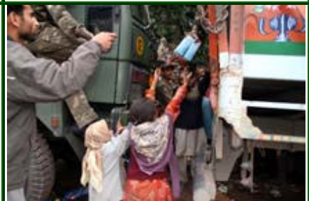
Milk bags being distributed to the community by a local NGO with the help of the Army.