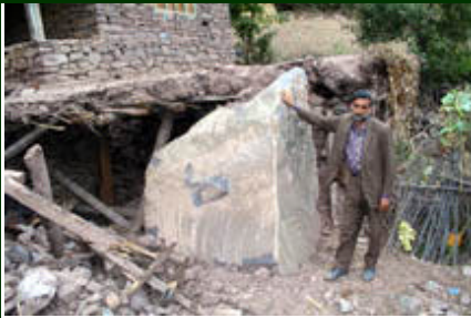
A helpless victim who lost his shelter and all of his belongings.