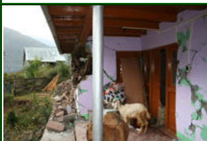
Earthquake devastation leaves not only humans destitute, but livestock also.