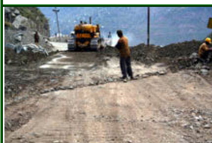
Kilometres of community access are badly damaged and the government is rapidly responding to repair them.