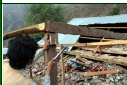
A victim trying to join some wooden poles with a hope to prop up a temporary and safe place before snowfall.