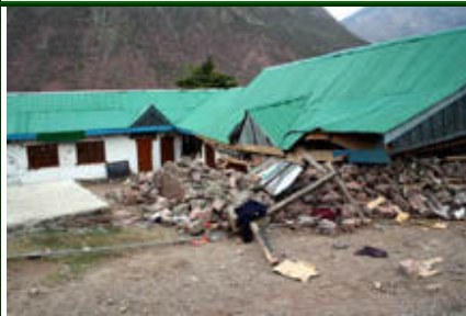
Badly damaged shelters are dotted everywhere.