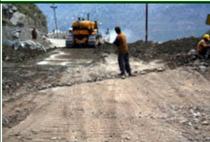
Kilometres of community access are badly damaged and the government is rapidly responding to repair them.