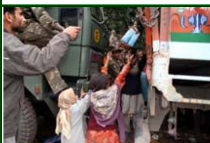
Milk bags being distributed to the community by a local NGO with the help of the Army.