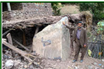
A helpless victim who lost his shelter and all of his belongings.